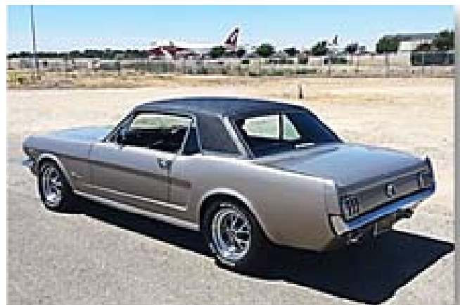
Ward's 1965 Mustang undergoing restoration, and the finished product.