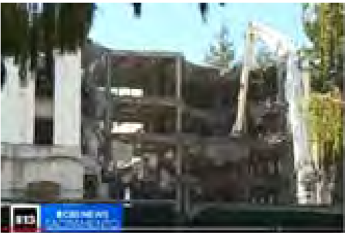
... and coming down in July of 2023.

The demolition of the State Capitol Annex has been a big local news story—but what about the news reporters who actually worked in the old east wing? How is their eviction impacting the media's access to lawmakers? This will be the intriguing topic of the October 10 VBL meeting.