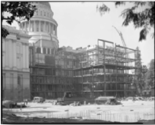
The Capitol Annex going up in 1949 ...